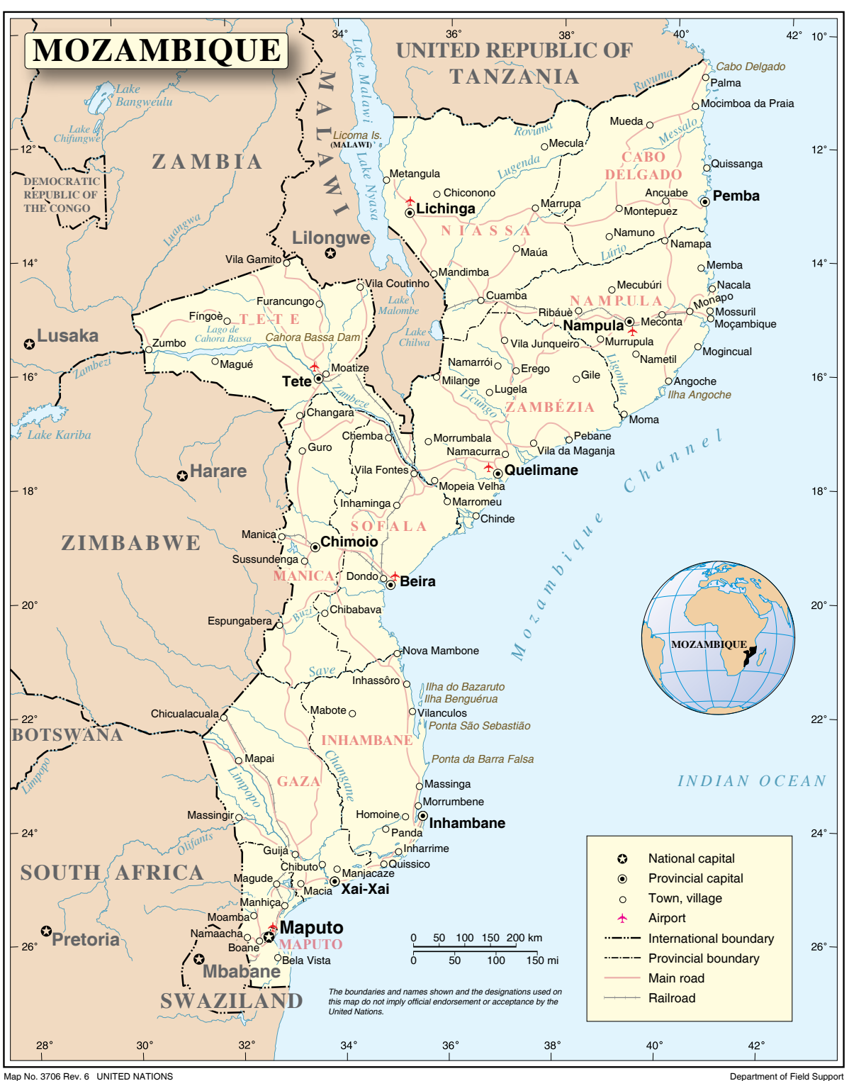
Map No. 3706 Rev. 6 UNITED NATIONS May 2016